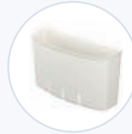
Rear Supply Basket, Polymer WF-RSUPBASK-P