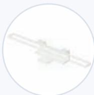
Roll Stand Laptop Security Bracket WF-RLT-SECBRKT