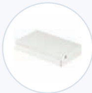
Drawer, Single, Locking WF-DRWR-SL