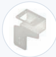
Bracket, Scanner Cradle, Code 2600 WF-SCNBRKT-CD2600