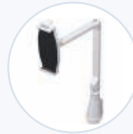
Tablet, Surface Mount AM-TABMNT-S