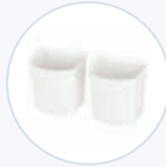
Rear Supply Bins Kit WF-RSUPBINS