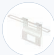
Laptop Security Bracket WF-CLT-SECBRKT