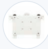
Tablet Mount, Tilt/Swivel WF-TAB-MNT