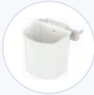
Side Supply Bin Kit WF-SSUPBIN

Equipment changes over time and our line of accessories can be added or removed to fit your application needs.