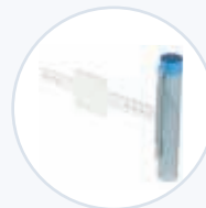
Cup Holder, VESA Mount WF-MEDCUP-VESA