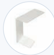
Bracket, Printer, Zebra QLN220 WF-PBRKT-ZQLN2