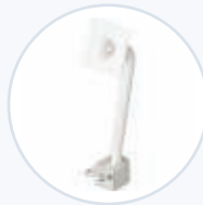
VESA Mount, Light Duty WF-VESA-MNT-LT