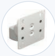
VESA Mount, Tilt/Swivel WF-VESA-MNT