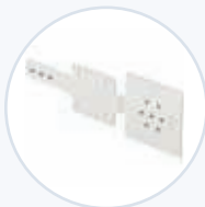
e-Signature Pad, VESA Mount WF-SIGNPAD-VESA