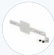
Bracket, Scanner, VESA Mount WF-SBRKT-VESA