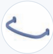
Extended Rear Handle, Steel WF-EXRHAND