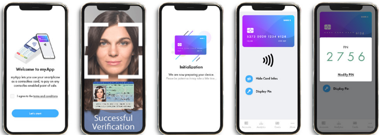
Welcome and Initialization