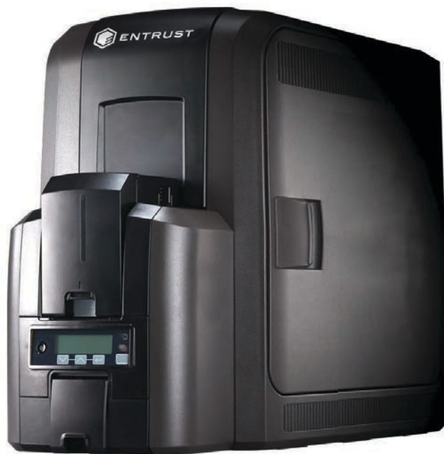
Artista CR805 Retransfer Printer

The design and options with this platform provide almost endless possibilities to meet the demands of card programs in the market today. The Artista CR805 Retransfer Printer with Card Lamination Module is available in the 125 single hopper solution or multi-hopper option with six removable hoppers. Each hopper holds up to 125 cards.