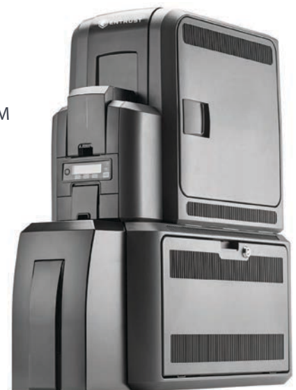
Artista CR805 printer with CLM

The Artista CR805 printer will work with the same lamination module that's available with the CD800™ card printer today, as long as the metal rollers are changed to rubber rollers with the upgrade kit. Customers with an existing CD800 card printer with CLM can upgrade the print technology, transitioning from direct-to-card to retransfer printing by replacement of the CD800 card printer with the Artista CR805 printer on top of the laminator and by replacing the metal laminator rollers with rubber lamination rollers.