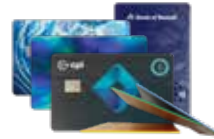
Card Style Features