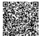
Order ID Supplies