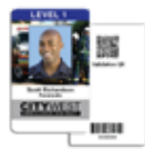
1D, 2D, & QR Barcodes